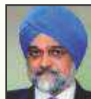
Dr. MS Ahluwalia Dy. Chair, Yojana Ayog