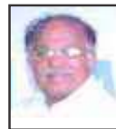
Prof. PJ Kurien Dy. Chairman, Rajya Sabha