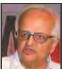
Dr. Bimal Jalan Governor, Reserve Bank of India