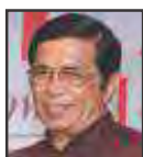
Sh. Oscar Fernandes Member of Parliament