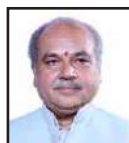
Sh. Narendra Singh Tomar Minister of Agriculture