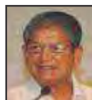
Sh. Harish Rawat Chief Minister, Uttarakhand