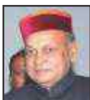
Prof. PK Dhumal Chief Minister, HP