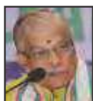
Dr. Murli M Joshi Member of Parliament