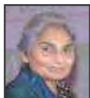
Dr. Amrita Patel Chairman, NDDB