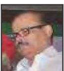
Sh. Tariq Anwar Member of Parliament