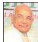
Prof. KS Solanki Governor of Haryana & Punjab