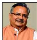
Dr. Raman Singh Chief Minister, Chhattisgarh