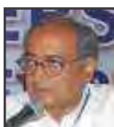
Sh. Digvijay Singh Member of Parliament