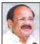
Sh. M. Venkaiah Naidu Union Minister of Urban Development